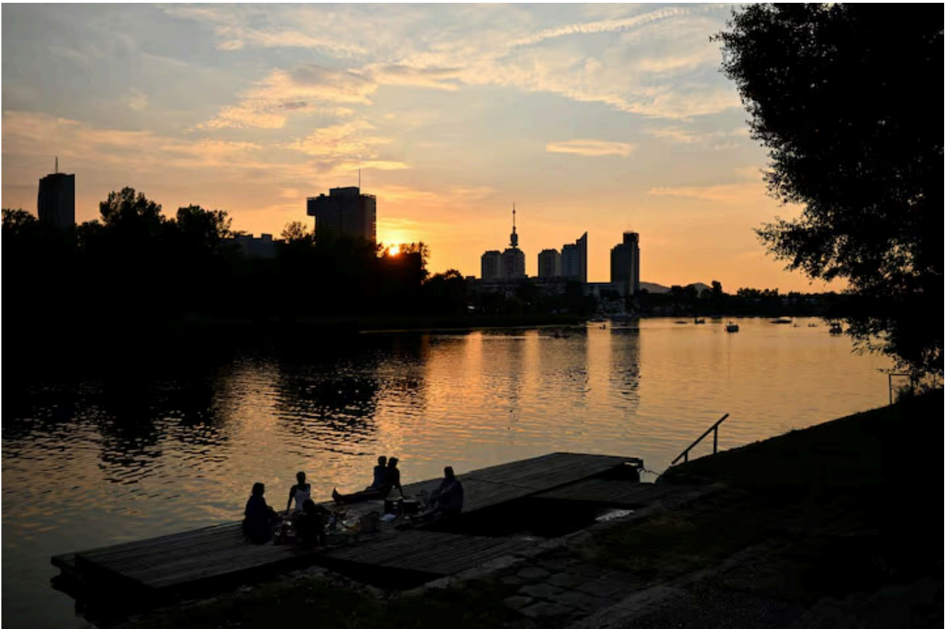
Vienna, August 14, 2024.

Fire services in the capital were called out more than 450 times on Saturday as the downpours caused traffic chaos and disrupted rail transport, according to ORF.