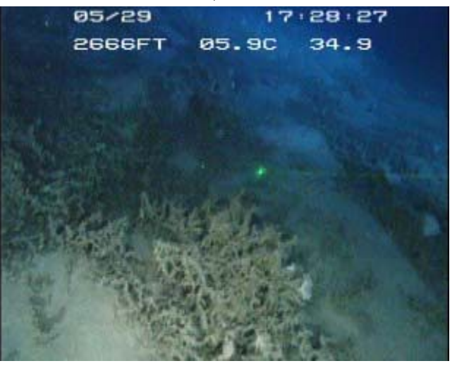
Image A: Hard Corals with Attached Fauna 25° 36.953' N, 79° 49.315' W