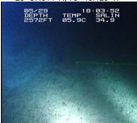
Image C: Hard Corals with Attached Fauna 25° 37.072' N. 79° 49.489' W

05/29 18:22:43 DEPTH TEMP SALIN 2479FT 05.9C 34.9