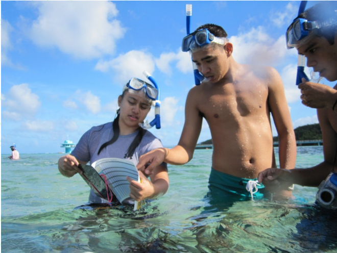
Members review data collected during In-Water Training in Piti

"Care for the Ocean as the Ocean Cares for Us"