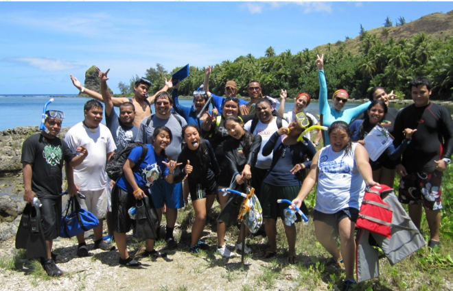
Members strike a pose after completing data collection at Fouha Bay in Umatac

"Care for the Ocean as the Ocean Cares for Us"