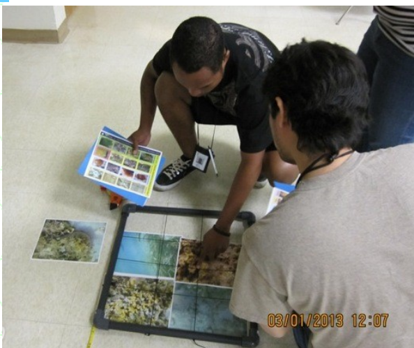
Members practice benthic cover survey during Classroom Training at University of Guam

So... Is protecting coral reefs your nature?