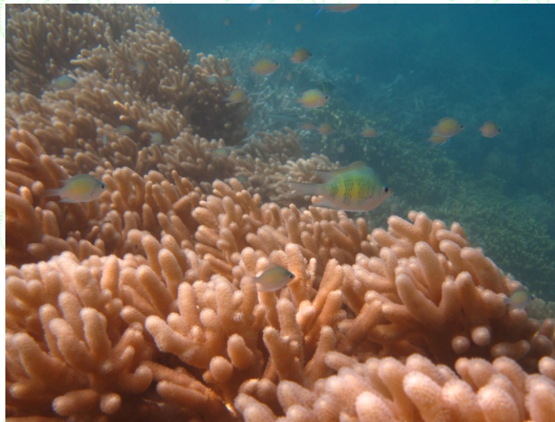
Underwater photo of corals and marine life taken by member in Piti Bomb Holes Marine Preserve

For more information or to get involved: