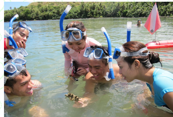
Members find an interesting marine animal during a marine species identification session at Fouha Bay in Umatac