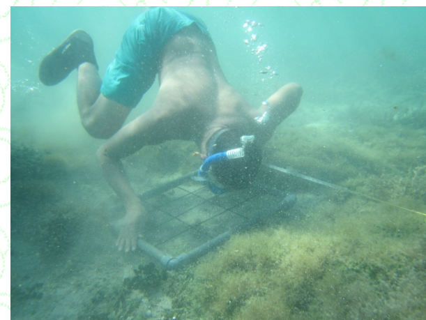
"What's on the sea bottom?" - Member quantifies coral, sand, and algae using a quadrat in Piti