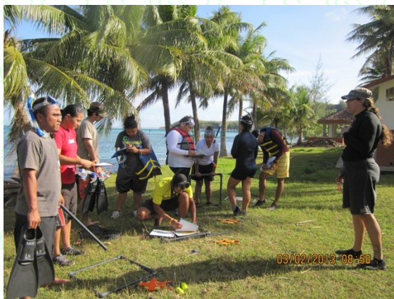
"Let's head out!" - Members prepare equipment in Piti

Love to snorkel and explore Guam's waters? Enjoy learning about marine species you discover? Then join the Guam Community Coral Reef Monitoring Team!