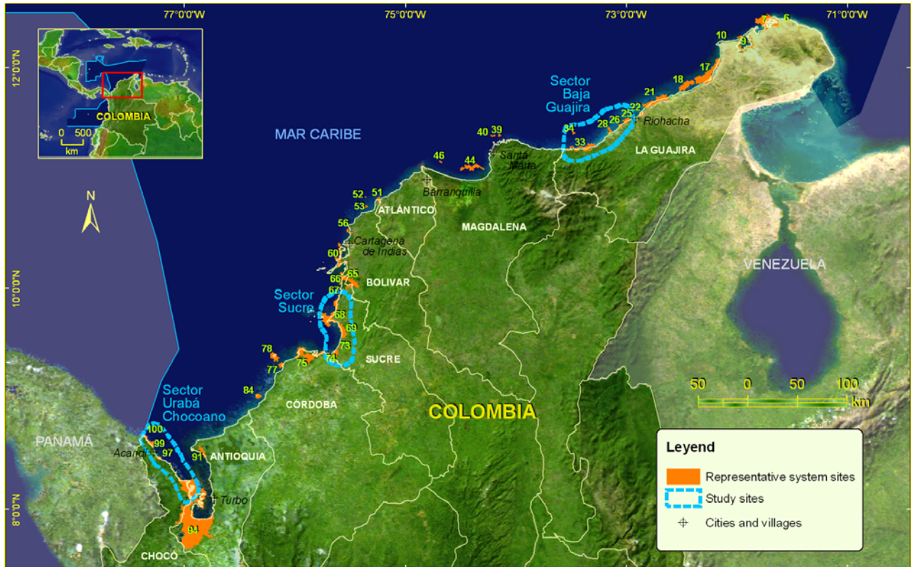
Figure 1. Priority conservation sites in the Caribbean of Colombia and localization of study sites.

Through the collaboration of the environmental coastal authorities and the information available from results of the integrated zone coastal planning from these particular areas, a list with the information of key stakeholders that have influence in the marine and coastal zone was obtained. Stakeholders correspond to local and regional administrators; users as representatives of the productive sector and organized communities of fishers and mangrove resources users; and information providers.