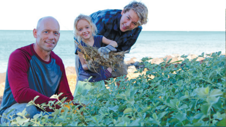
"The more time we spend caring for where we live, the more connected we feel to our community." —Alan Kuiper