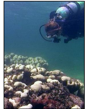
Figure 1 – BleachWatch observer.

“ Professional Observers ”: Throughout the Florida Keys, there are a variety of marine professionals that frequent the same reefs, most of whom have a better than average understanding of the area and the signs and affects of coral bleaching. Educational groups, marine life collectors, and commercial divers spend a considerable amount of time on the water, and are often more highly motivated to provide observations as the health of the reef directly relates to their professions. The dive tourism industry will also be approached, but because most operators and boat staff in the Keys do not enter the water, this group does not hold much promise for active reporting. However, dive and snorkel boats will be approached for their cooperation in assisting other volunteers to obtain access to the reefs, as well as helping to enlist additional recreational divers to volunteer by posting material in shops and on their vessels. Numerous Federal, State, and private or academic scientists actively conduct fieldwork throughout the Florida Keys every year. In many cases, these groups and individuals are already trained in observational techniques, and are often collecting data from the field on coral health and reef conditions, making participation in the program minimal additional effort. These observers should require little training, but will likely be able to provide additional information beyond the lay person or “community observer”.